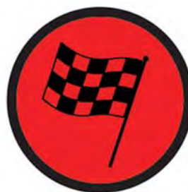
Flying Finish Actual