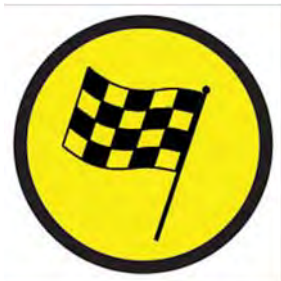
Flying Finish ahead