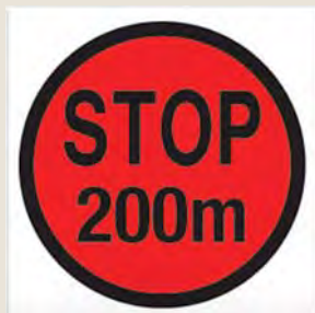
Stop Point in 200meters